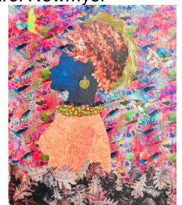
Eshe Lea Craigie-Marshall

Now celebrating 41 years in the nation's capital, Zenith is recognized for its unique mix of contemporary art in a wide variety of media, style and subject. The gallery provides high-quality acquisition, art consulting, commissioning, appraisal and framing services, through its gallery/salon/ sculpture garden off 16 th Street at 1429 Iris St NW, WDC 20012. Zenith also curates rotating exhibits at the Eleven Eleven Sculpture Space at 1111 Pennsylvania Avenue NW, WDC 20004.