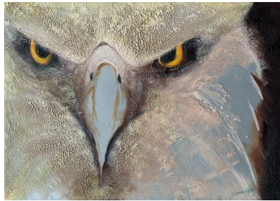
Eagle Eyes Carolyn Goodridge