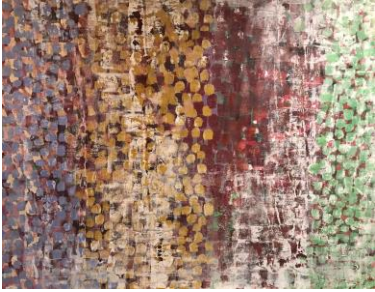
All Seasons at Once Sabiyha Prince