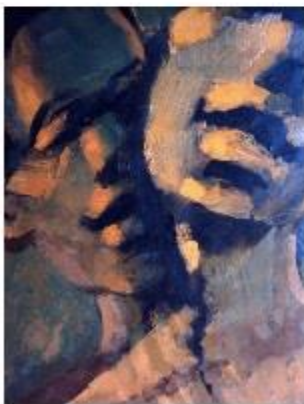
Love Letters #45