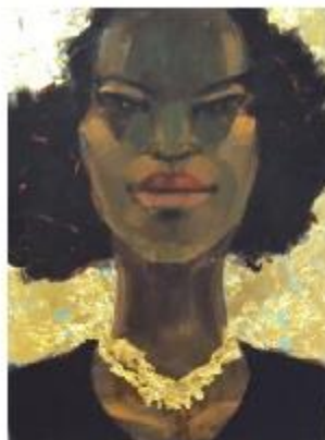
Golden Necklace II