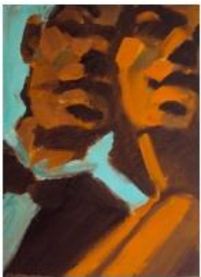
Love Letter #42