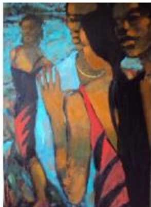
Along the River

Opening Reception to Meet the Artist: Saturday January 11, 3 pm-7pm